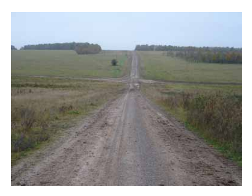
A lonely track across the plain

The emptiness made it a hostile place for travellers, who passed quickly through to more familiar and peopled landscapes.