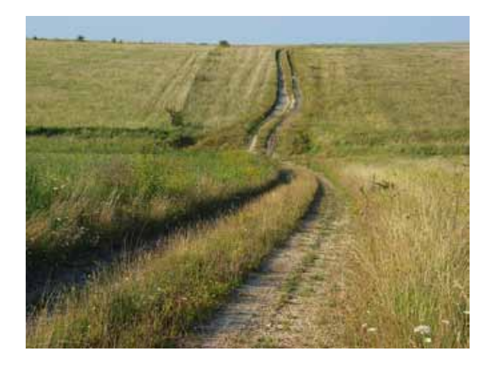
Tank tracks across the grassland

The Arts and Humanities Research Council (AHRC) for providing funding for the production of this walk under the programme 'Enhancing the Role of Arts and Humanities Perspectives on Environmental Values and Change: Policy, Practice and Public Discourses'