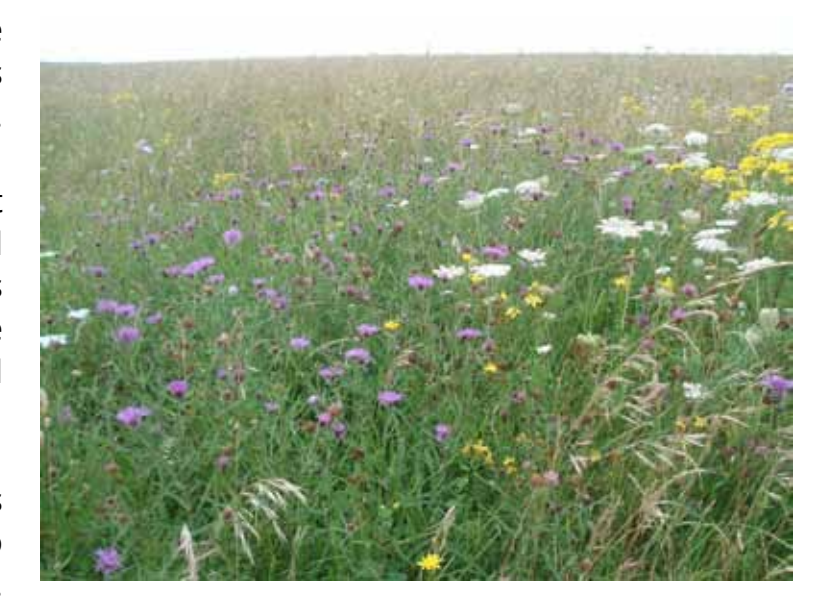
Abundant flowers on chalk grassland

Chalk was formed during the Cretaceous period about 65 – 90 million years ago when global sea levels were much higher. Northern Europe, including Britain, was covered by a shallow and warm sea.