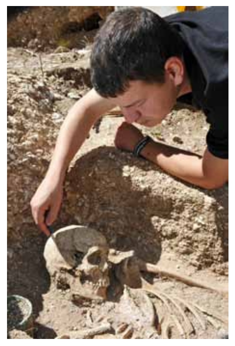
Soldier from The Rifles involved in an archaeological dig at Barrow Clump

The report, published in 1973, laid the foundations of military environmentalism which has ensured responsible stewardship of Salisbury Plain and other precious landscapes.