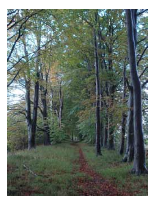
Path along the prehistoric Long Barrow

Archaeologists have found evidence of some cultivation in medieval times in some areas but large parts went out of cultivation as long as 2,000 years ago, and have been mostly left alone since. Hence this is one of the most remarkable surviving prehistoric and Roman landscapes in Europe.