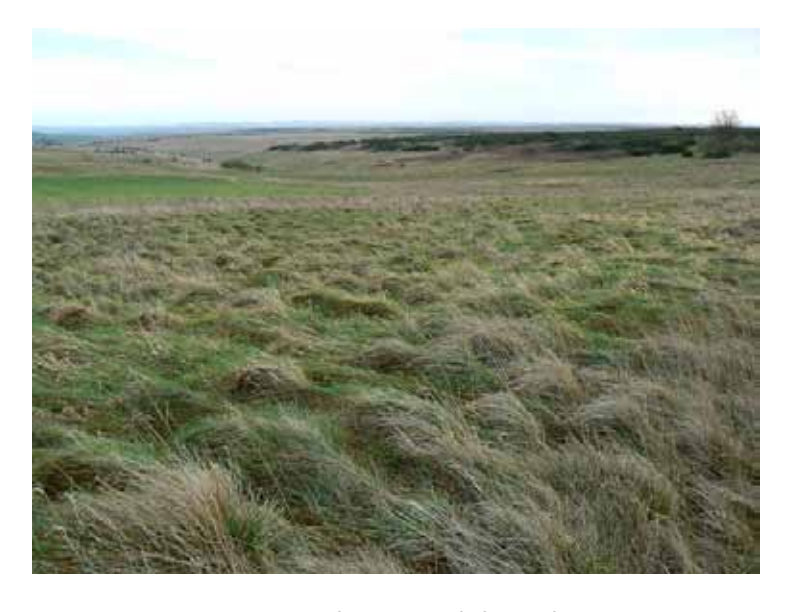
Stormy weather over Salisbury Plain

Herman Melville also mentions Salisbury Plain in Moby Dick. He compares its open grasslands to the open oceans, and concludes that it is one of the bleakest places on the planet!