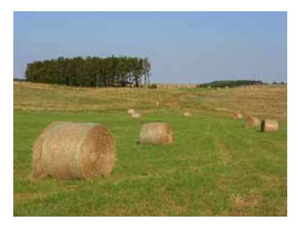
Farmland on the edge of Larkhill Artillery Range

We heard earlier about the lack of farming on the plain over recent centuries and also how the military presence has meant that there has been no ploughing or crop-spraying which may have damaged the prehistoric archaeological sites or grassland ecosystems. So you may wonder why there is farmland here.