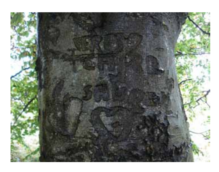
See what tree graffiti you can spot

Look carefully at the trunks of the trees along the path and you will see etchings and carvings made by soldiers over the years. The proper name for tree graffiti – carved into the trees by bayonets – is arborglyphs.