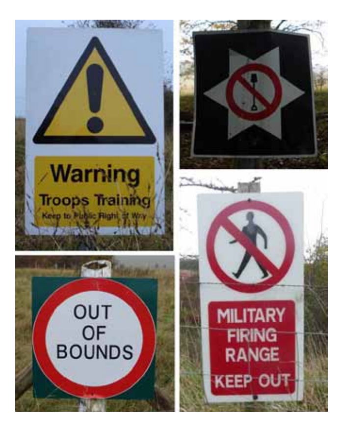
Military signs

This means that military land is largely undeveloped and kept in a natural state making it some of the most unspoiled and exhilarating landscapes in the country.