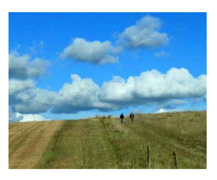
An exhilarating walk in a landscape of big skies

You may be surprised to discover that the presence of the military has benefitted archaeological sites and natural habitats.