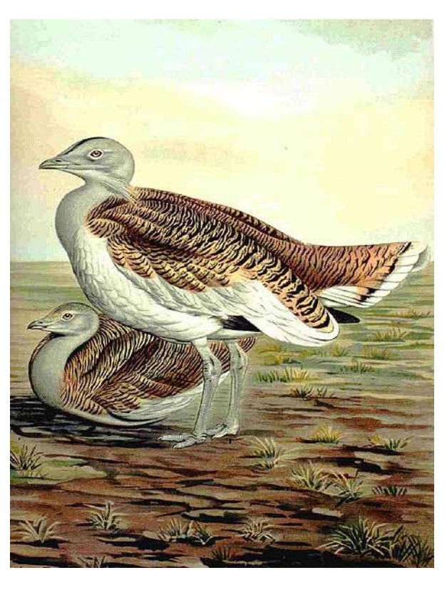
Great bustard (Otis tarda)

But Bustards were a prize hunting trophy, and due to their size and slowness, they were hunted to extinction in Britain by 1840.