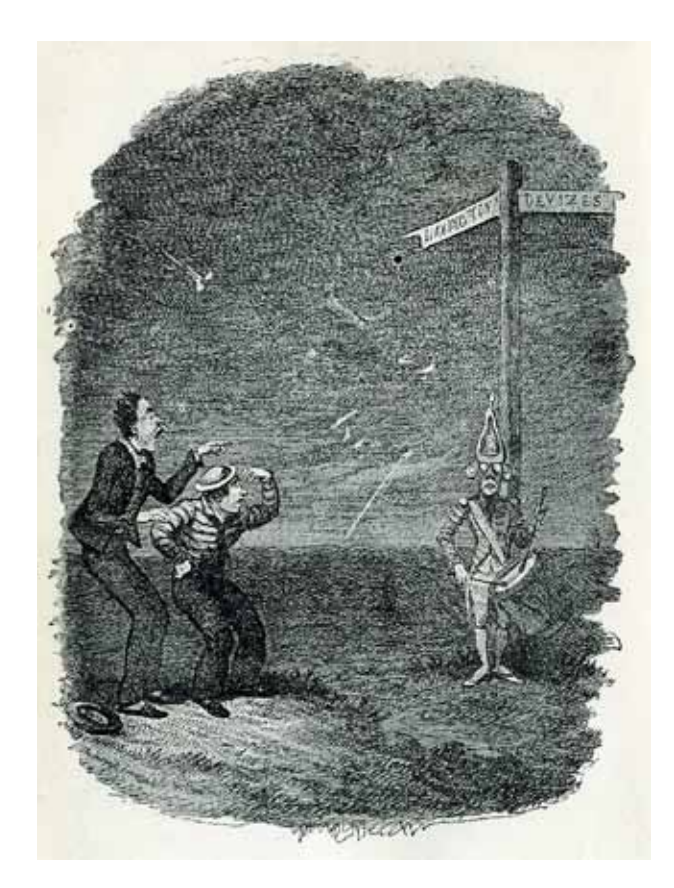
The ghost of the dead drummer boy haunting the Plain from The Ingoldsby Legends

Oh, Salisbury Plain is bleak and bare, At least so I've heard many people declare. For fairly I confess I was never there; Not a shrub nor a tree Nor a bush can you see: No hedges, no ditches, no gates, no stiles Much less a house, or a cottage for miles; It's a very sad thing to be caught in the rain When night's coming up on Salisbury Plain