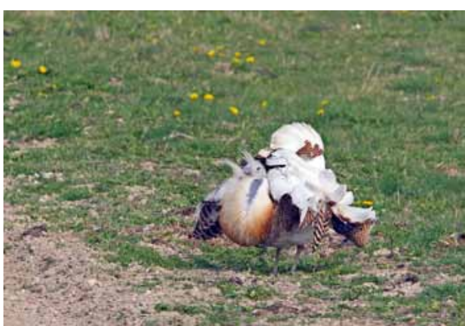
A young Great Bustard in flight (left) and an old male Great Bustard displaying or 'lekking' (right)