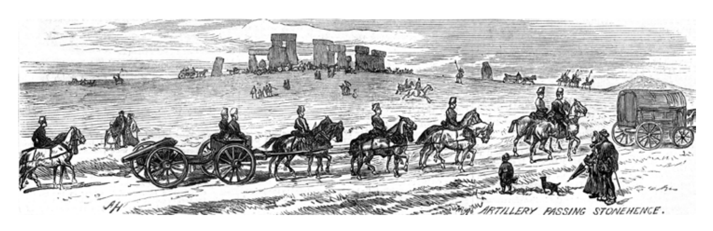
During the course of military manoeuvres on Salisbury Plain local people watch members of the Royal Artillery pass by with Stonehenge in the background (1872)

At this time, soldiers slept in tents and a sketch from the time shows horses pulling a cannon in the shadow of Stonehenge nearby.