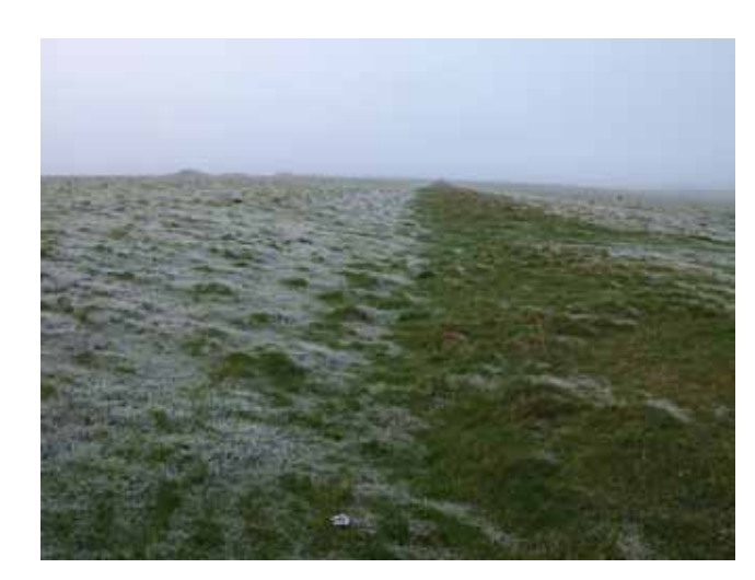
Fog descending on the empty expanses of the plain

As you walk through this landscape, consider how the lie of the land and the changeable weather conditions must have challenged soldiers-intraining for over a century.