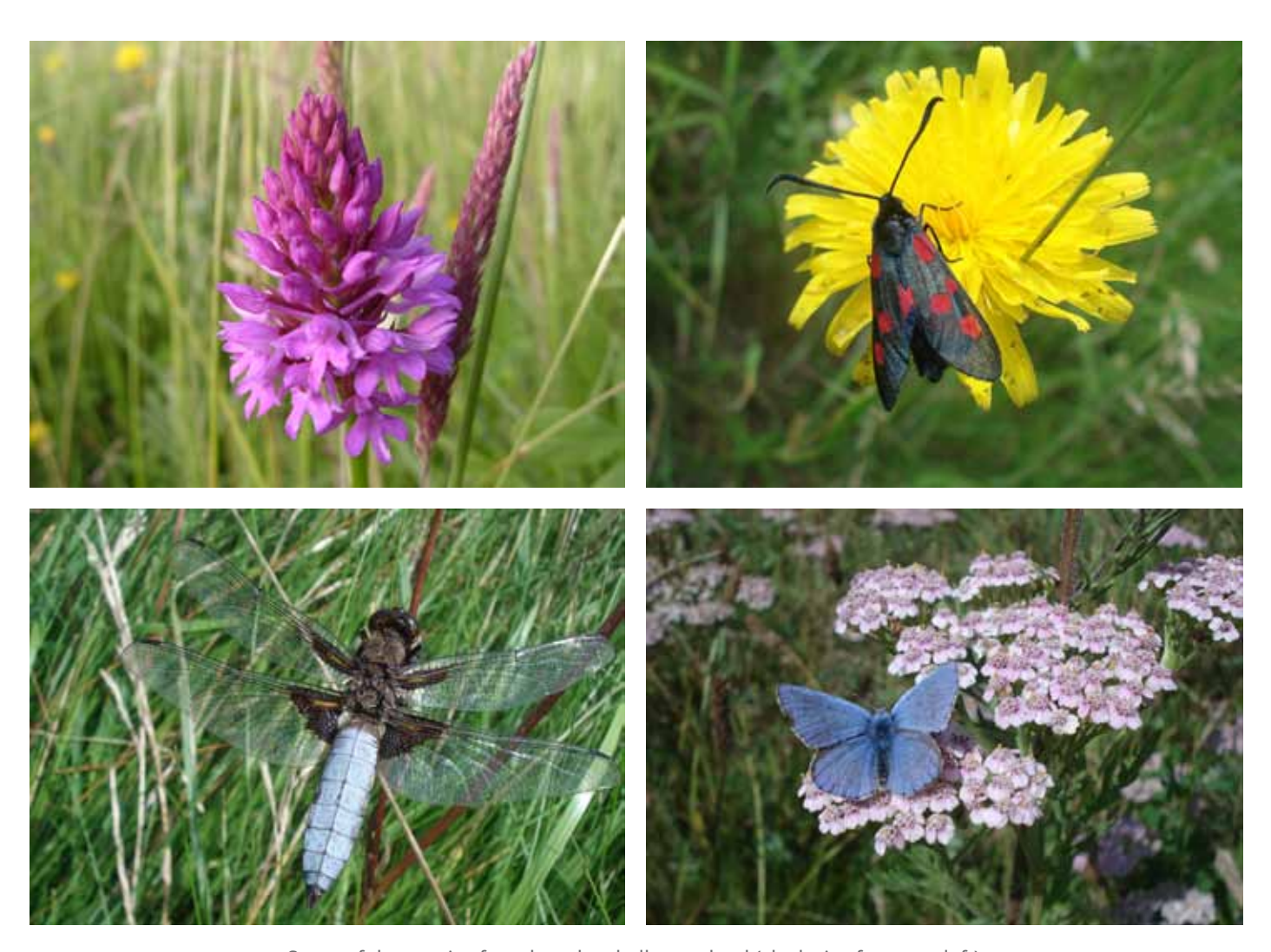
Some of the species found on the chalk grassland (clockwise from top left): Fragrant Orchid, Spotted Burnett moth, Chalkhill Blue butterfly, Broad-bodied Chaser dragonfly

In fact Salisbury Plain is now the largest surviving unimproved chalk grassland in Northern Europe and makes up 40 per cent of chalk grassland left in the UK. It is also protected as a Site of Special Scientific Interest and a Special Area of Conservation. These designations recognise the environmental importance of this place, and ensure its protection in the future.