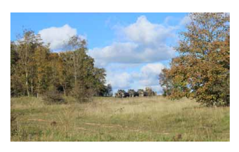
Thickets of trees provide cover for tanks as well as habitat for different species

These dense patches of woodland provide shelter for troops out on operations and act as a strategic landmark in the open countryside.