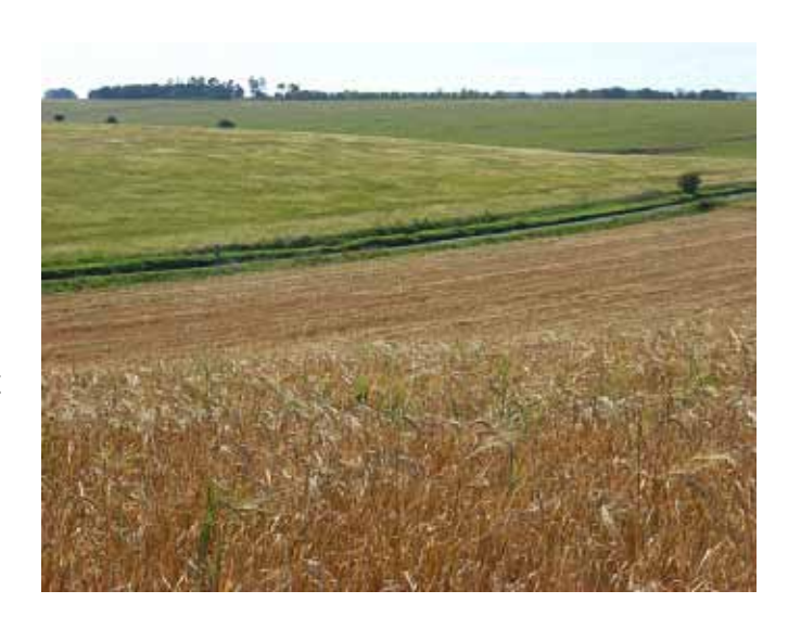
Fields near Tilshead

What you can actually see will vary depending on the time of year but it is likely to be an arable crop of some kind. You may also be able to see cattle grazing around here.