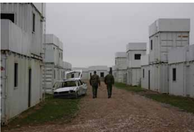
FIBUA village recreating East Germany (left) and Iraq (right)