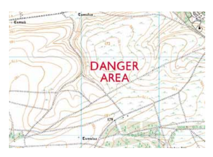
A open grasslands are ideal for military manouvres © Ordnance Survey

Meanwhile Westdown Camp, on the outskirts of Tilshead village, is home to the Defence Infrastructure Organisation which runs the entire UK military training estate.