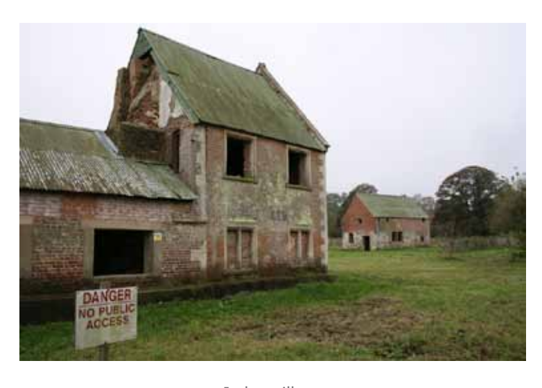
Imber village

The ghost village of Imber is a recent addition to the stories, myths and legends that have been inspired and set in this unique landscape.