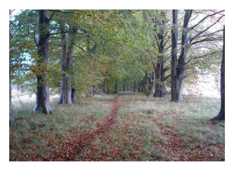
The prehistoric Long Barrow

The walk follows public footpaths that penetrate deep into the heart of the military training area taking you out of your comfort zone and to experience a totally new kind of landscape (don't worry, it's safe and legal).