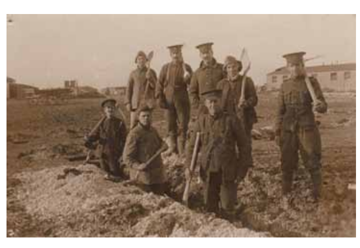
Canadian soldiers practicing trench digging (1914)

The hard ground and bitter cold of the wintry plain in 1914 was nothing compared to the hellish theatre of war the men would soon join, but it was still a cause for concern, even for Canadians used to the cold!