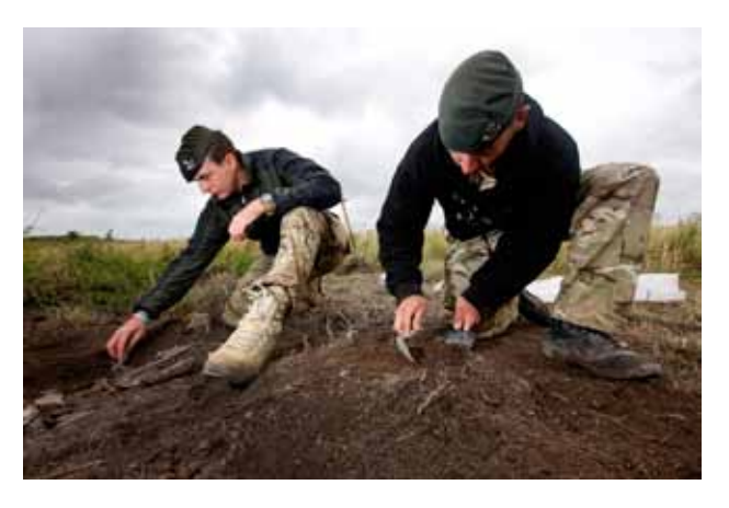
Soldiers from The Rifles involved in an archaeological dig at East Chisenbury Middden

The Nugent Committee recommended a more environmentally-aware approach and said the military should recognise and respect the fact that civilians valued the landscapes in which they were training, and should be allowed to enjoy them too.