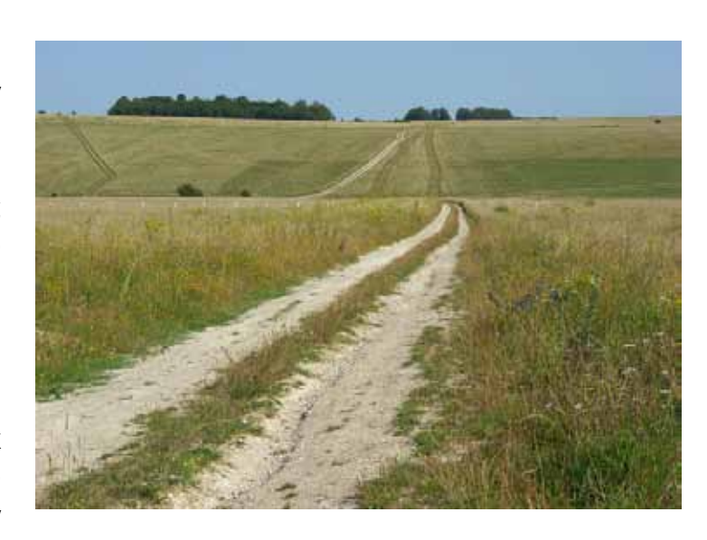
Tank tracks in the chalk

This walk takes us through beautiful chalk grassland scenery and to some impressive prehistoric sites so that we can see 'military environmentalism' in action.