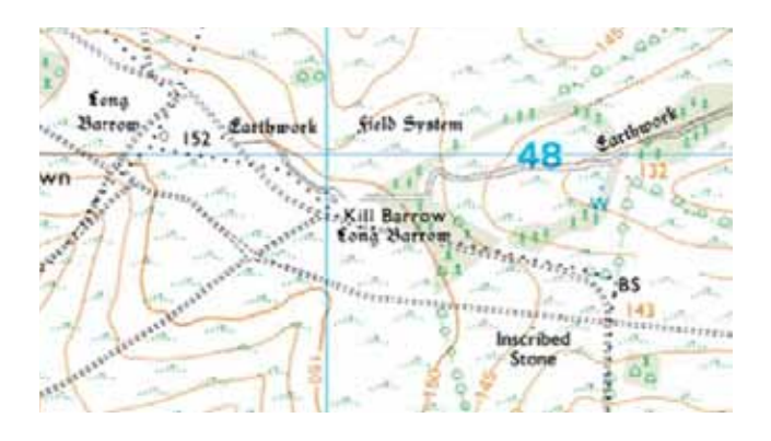
Prehistoric sites are scattered across the whole area © Ordnance Survey

Thousands of archaeological sites here have survived intact. In fact, on the training area itself, there are 2,300 sites dating back to 4,000BC. Look on an OS map for words such as tumulus or tumuli, earthwork and long barrow in an old-fashioned font – these all indicate prehistoric sites. In fact you have been walking along a Long Barrow.