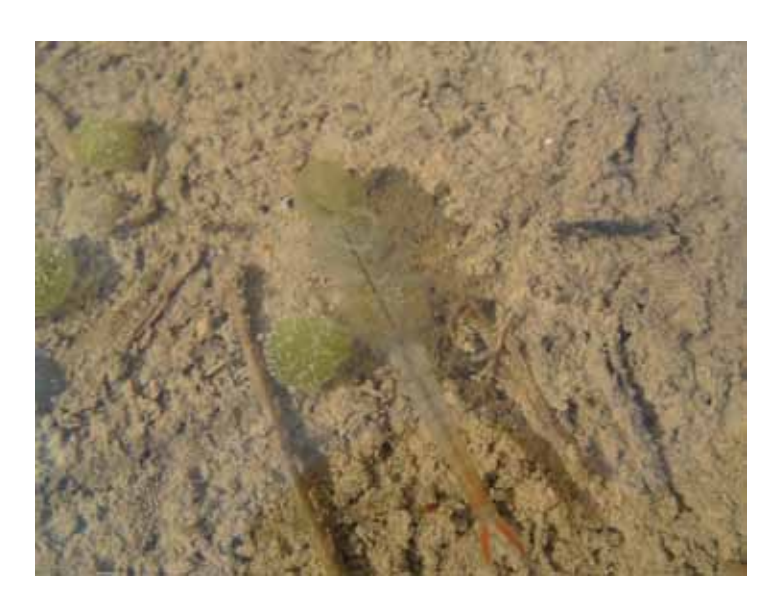
A male Fairy Shrimp

This is the tale of perhaps the most surprising relationship on the plain: the enormous tank and the tiny Fairy Shrimp.