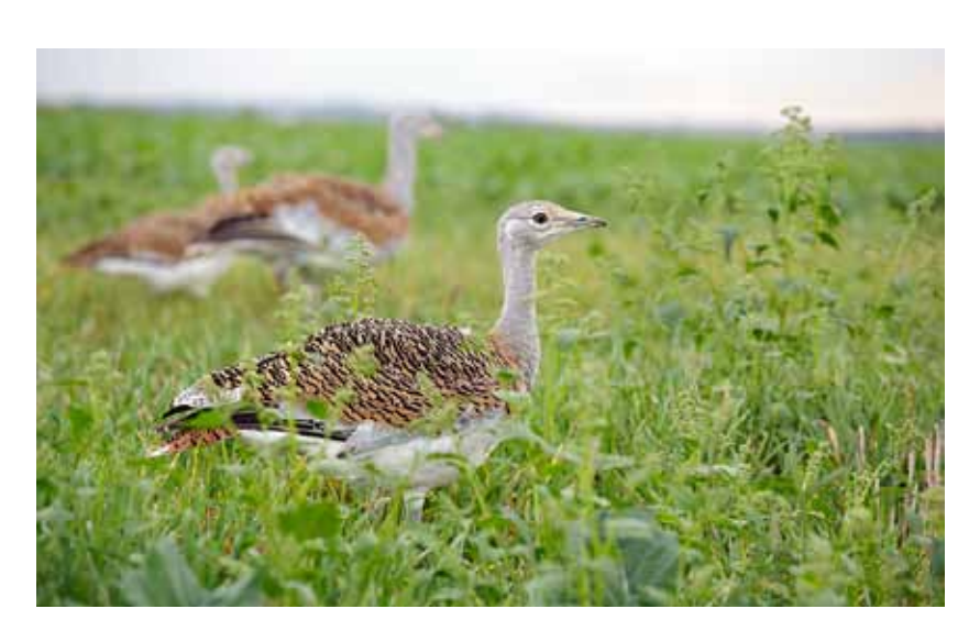
Young Great Bustards

In part of the poem we heard earlier Wordsworth describes the eerie shriek of the birds across the plain.