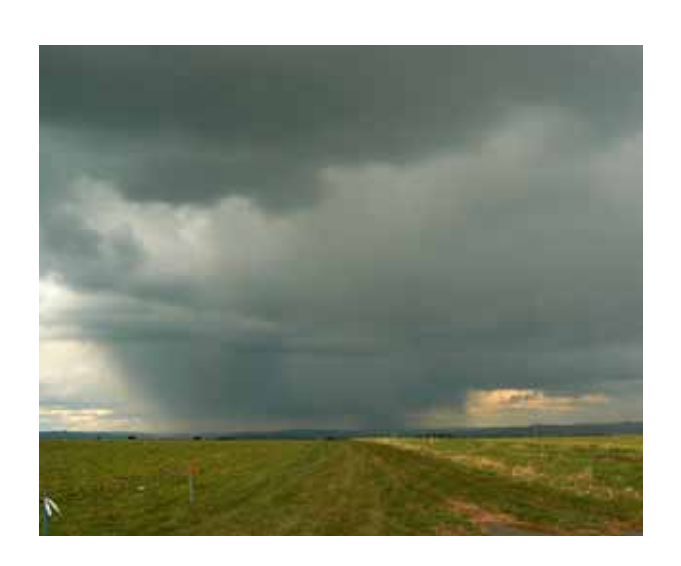
Stormy weather over Salisbury Plain

The first is 'Salisbury Plain' by William Wordsworth, whose walk across this landscape in 1793 inspired these words: